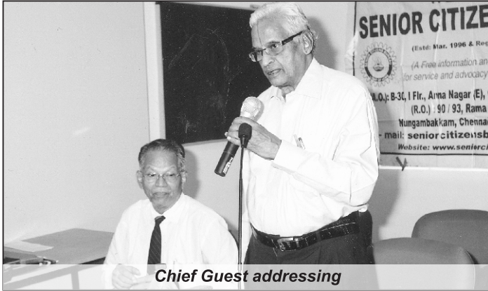
Chief Guest addressing